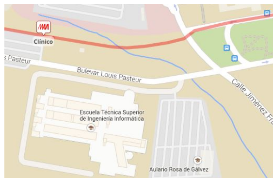
Location of the University - Campus de Teatinos in Malaga and E.T.S. de Ingeniería Informática in the Campus